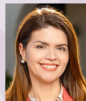
Mayor Regina Romero