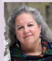
Dr. Robin Wall Kimmerer