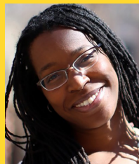
Dr. Tiya Miles